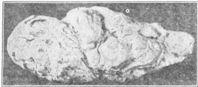
Fig. 3. Phosphate Nodule. NE of SE \frac{1}{4} Sec. 33 T. 4 S., R. 9 W. 1. mile N of extreme SE Corner of Cotton County, Oklahoma. Natural Size. A. C. Shead.

The phosphate has evidently come up in water solution and been